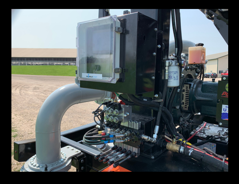
R Braun Inc.'s pipeline system paired with our top notch dragline application equipment make a perfect combination for a smooth application season! From our Mobilestar ™ pump control with autothrottle line (pipeline) protection to multiple applicator options off the end of your pipeline system, we have you covered. Call today to discuss what R Braun Inc.'s manure application systems can do to improve your operations bottom line... "All you have to do is ask!"